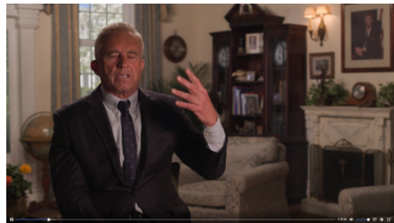
Robert F. Kennedy: ‘VAERS may be understating vaccine injuries by over 99 percent.’

‘Doctor Fauci’s refusal to fix the Health and Human Services [HHS] department’s notoriously dysfunctional vaccine injuries surveillance system VAERS constituted inexcusable negligence. HHS’s own studies indicate that VAERS may be understating vaccine injuries by over 99 percent.’